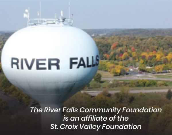
The River Falls Community Foundation is an affiliate of the St. Croix Valley Foundation

Managed by a 100% volunteer board, the Foundation is a community trust – ensuring gifts donated today will be wisely used to enhance the future well-being of the River Falls community.