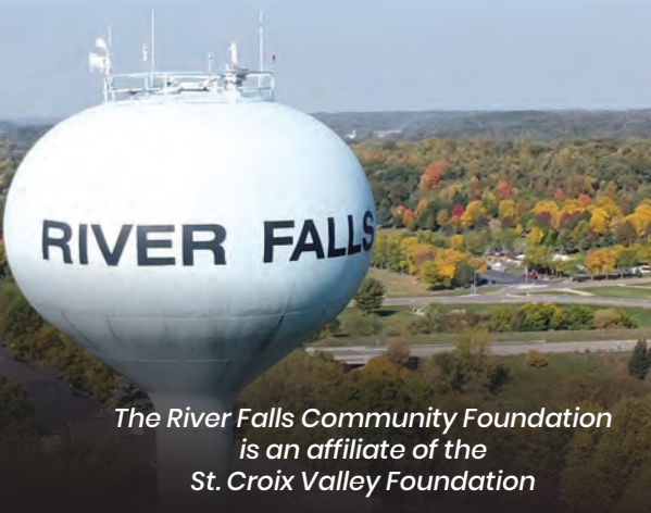
The River Falls Community Foundation is an affiliate of the St. Croix Valley Foundation

Managed by a 100% volunteer board, The Foundation is a community trust – ensuring gifts donated today will be wisely used to enhance the future well-being of the River Falls community.