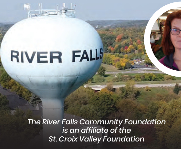
The River Falls Community Foundation is an affiliate of the St. Croix Valley Foundation

Managed by a 100% volunteer board, the Foundation is a community asset – ensuring gifts donated today will be wisely used to enhance the future well-being of the River Falls community.